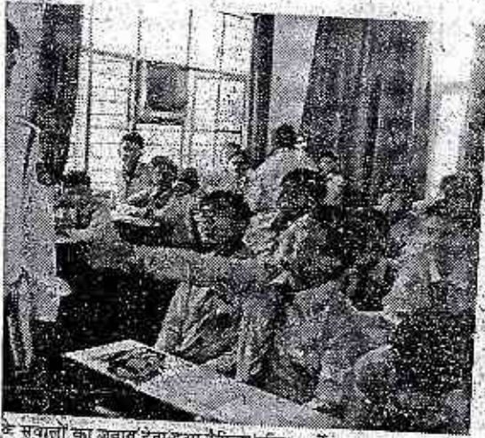
के सचिवों का जवाब देता हुआ ट्रैफिक पुलिसकर्मी।

साथ ही जमिंदार, मिडिल और सीनियर स्तर के जनों के लिए कई परियोजनाओं का आयोजन भी किया जा रहा है। इनके अलावा, जिला और रेज में विभिन्न कार्यक्रमों का आयोजन भी किया जा रहा है।